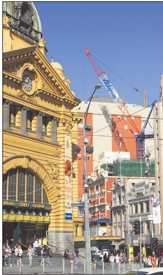
All of the apartments facing Flinders Street have magnificent views, while the higher floors overlook the Yarra River and parklands beyond.

Directly next to The Mutual Store, stage two of the works, Empire Apartments, involved the demolition of the existing three-storey Empire Arcade building and the construction of a 15-storey student accommodation complex, comprising a basement car park and 306 apartments.